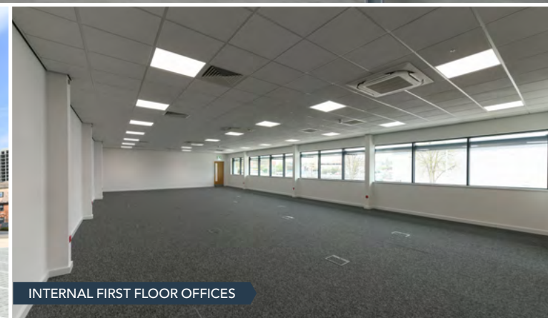
INTERNAL FIRST FLOOR OFFICES