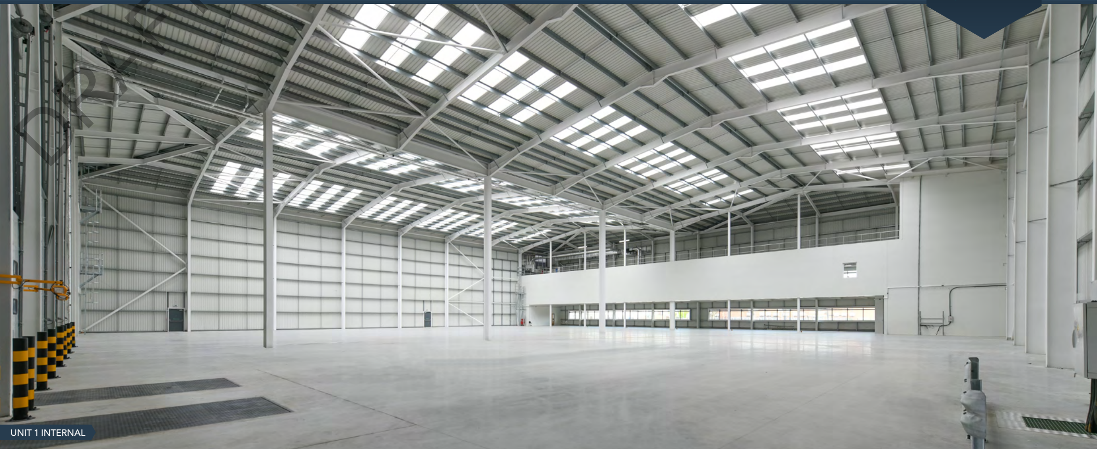
UNIT 1 INTERNAL